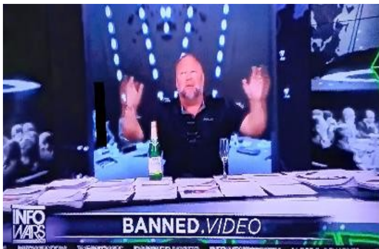
TCCR Screenshot successful. Happy 30 th Alex.

On April 15, 1994 Alex Jones started InfoWars. Thirty years ago today marks the beginning of Alex Jones' broadcast career. From the beginning Alex Jones reported on subjects the media would not touch. The problem for the left was the general public followed his reports because Jones provided news that proved to be correct. Today Jones is under attack from the Communists, which forced a profitable enterprise into bankruptcy. Jones considers the attacks as proof that his efforts have been